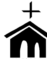
© J. S. Paluch Co., Inc.

The main goal of the Health program in St. Simon Stock is to reestablish healthy behavior among our families, by increasing their knowledge about nutrition. The program also provide information about most common diseases that targets our LATINO population such as diabetic, obesity, blood pressure and cancer that sometimes are relate to nutrition problem. In addition, this program provides fitness sections where our participants exercise for an hour every Thursday.